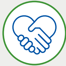
Health care Access and Delivery