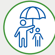
Support for Children and Youth