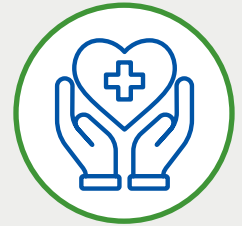
Equity and Social Determinants of Health