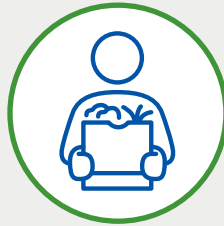
Food Insecurity and Access